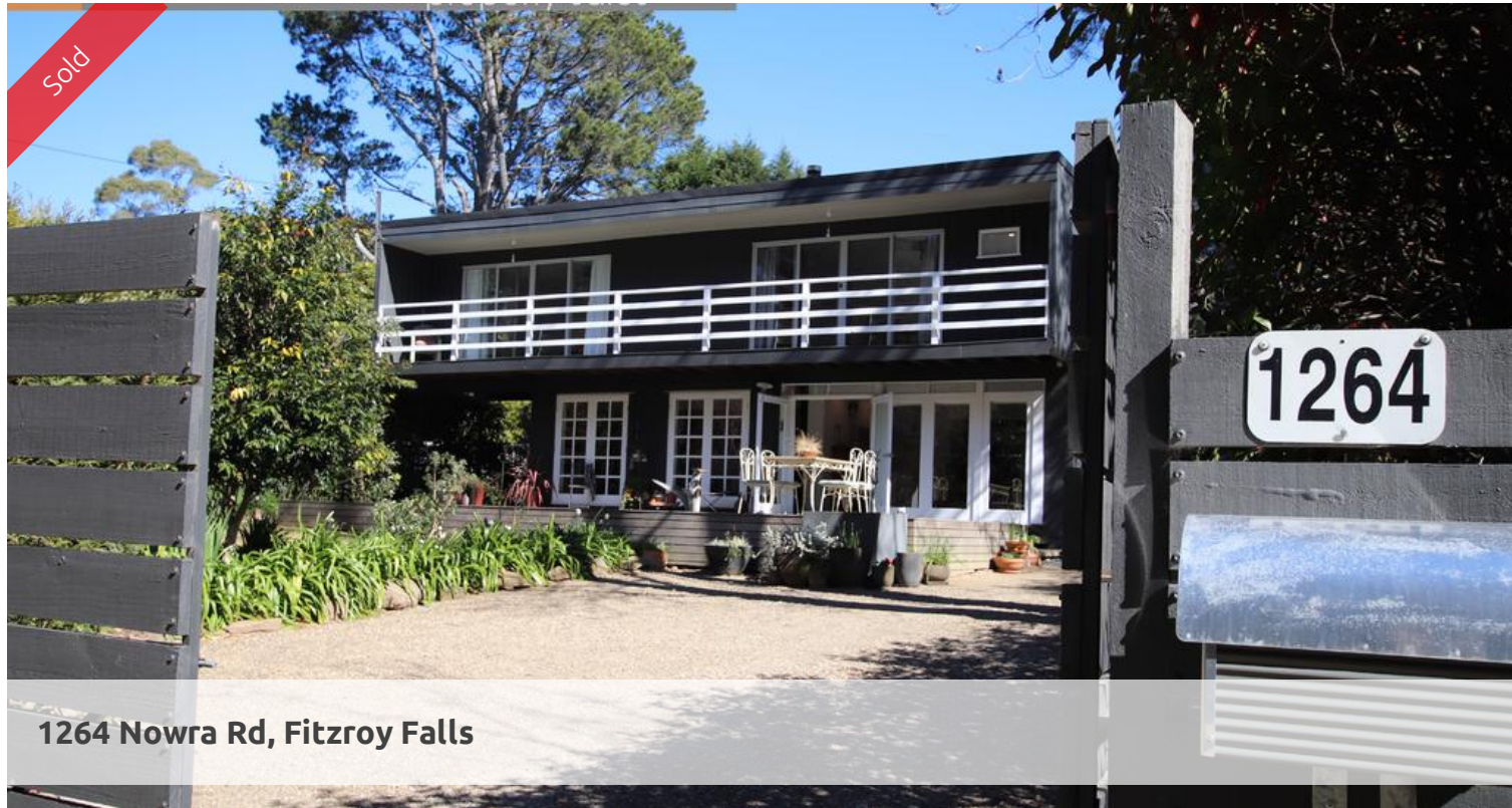
1264 Nowra Rd, Fitzroy Falls