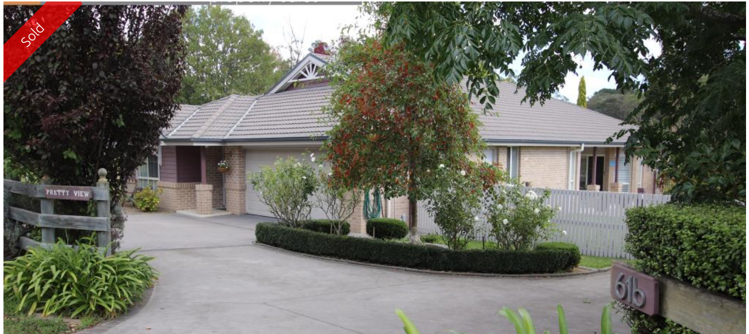
61B Southey St, Mittagong