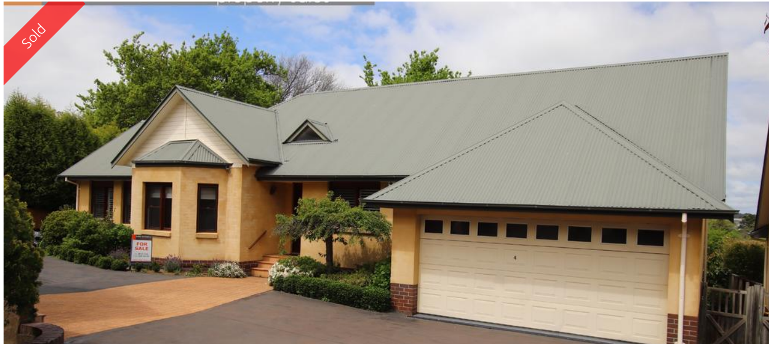
Villa 4, 130 Mittagong Rd, Bowral