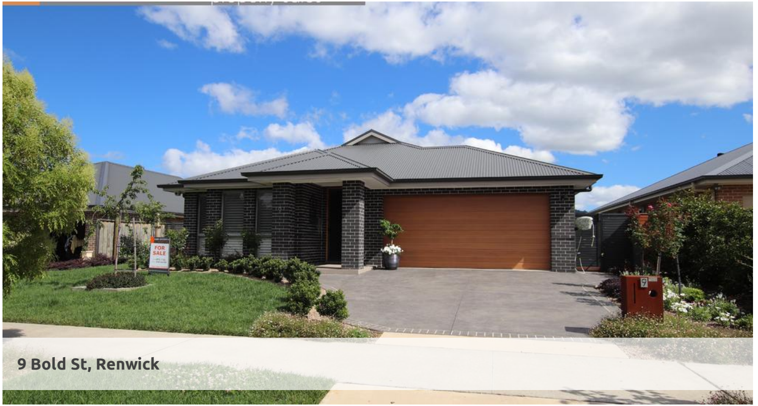
9 Bold St, Renwick