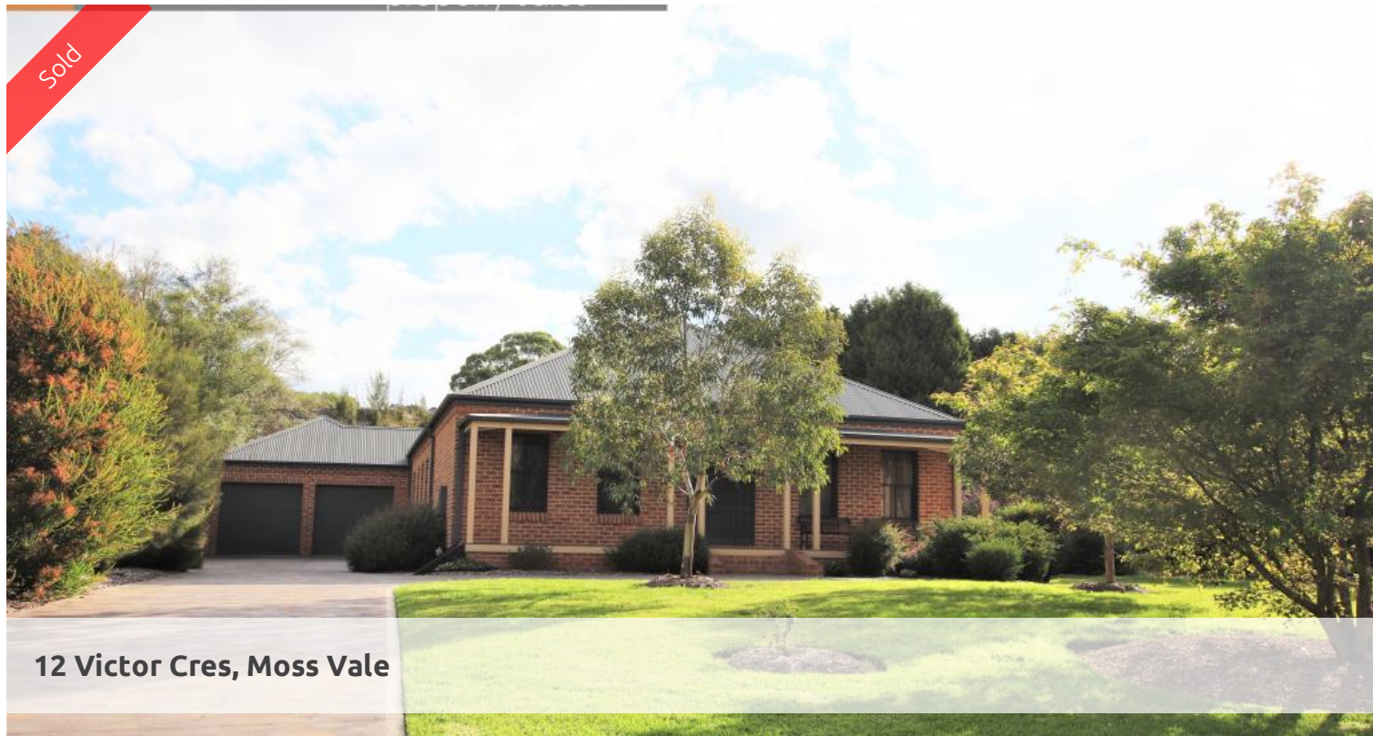
12 Victor Cres, Moss Vale