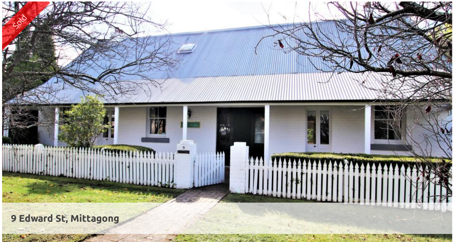
9 Edward St, Mittagong