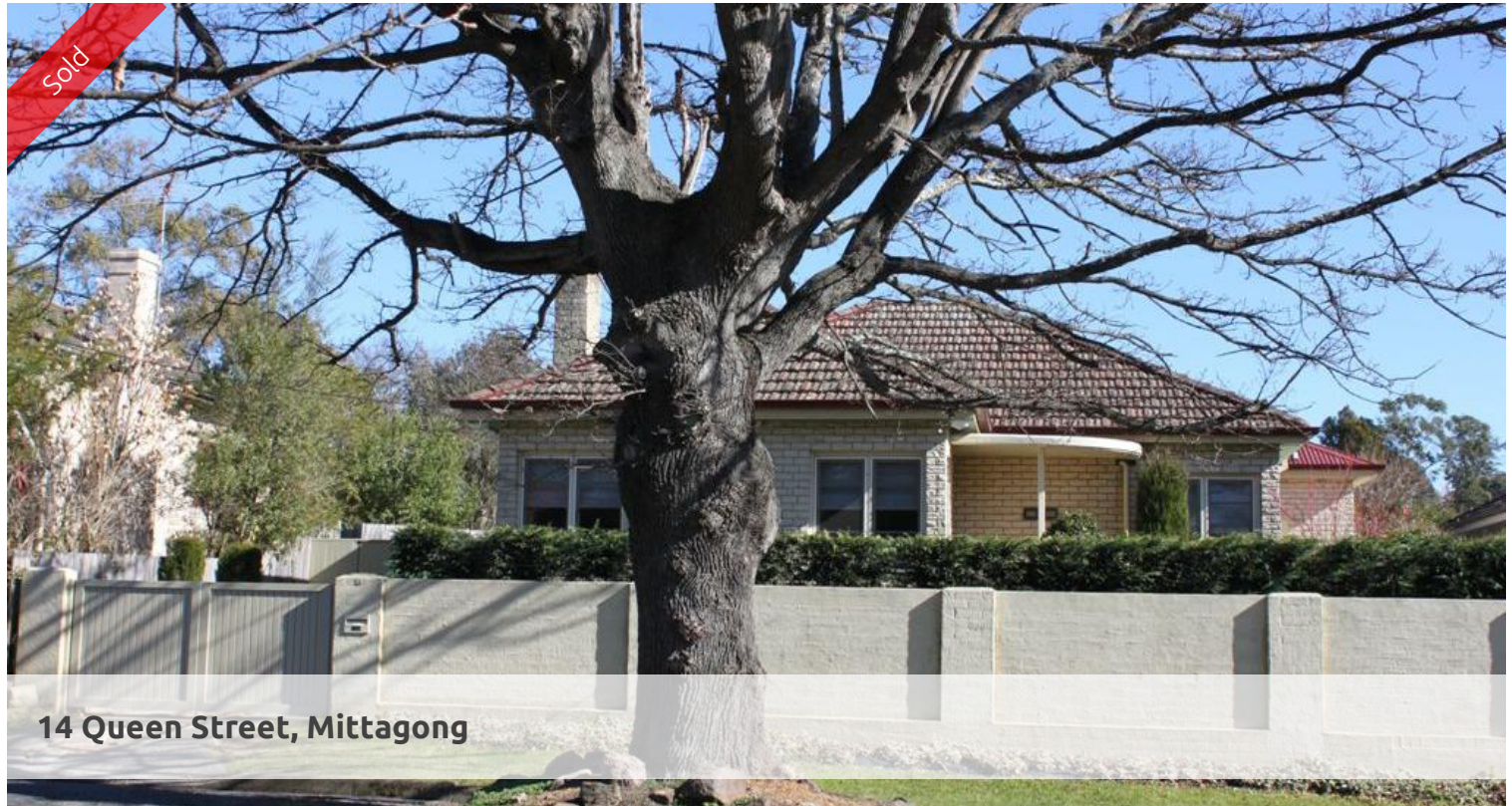
14 Queen Street, Mittagong